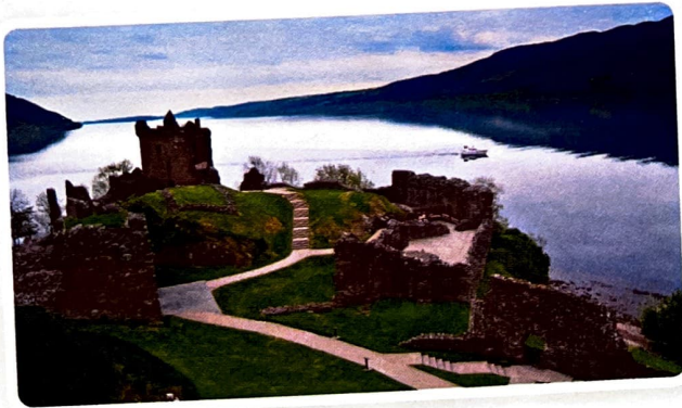
↑ Loch Ness and Urquhart Castle

Then there's the mystery of the Loch Ness monster or "Nessie". She is a big creature with a long neck 3 and four short legs. She likes swimming in the deep waters 4 of Loch Ness. People travel from all over the world to see this mysterious creature. Do you think she's real or just a myth?