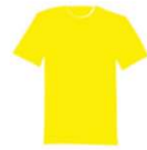
A YELLOW T-SHIRT