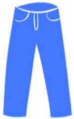
B BLUE TROUSERS