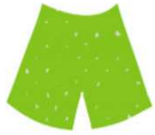
G GREEN SHORTS