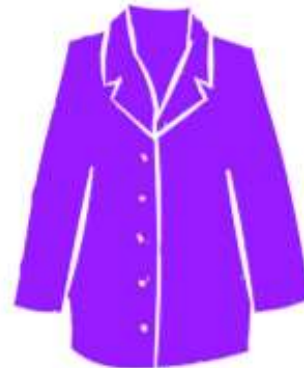
A PURPLE COAT