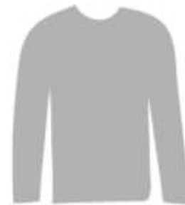
A GREY PULLOVER