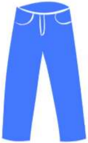
B BLUE TROUSERS