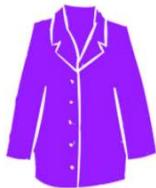
A PURPLE COAT