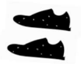
B BLACK SHOES