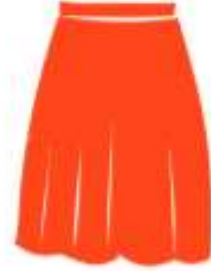
A RED SKIRT