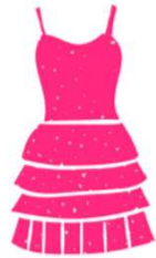
A PINK DRESS