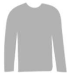
A GREY PULLOVER