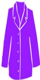
A PURPLE COAT