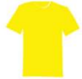
A YELLOW T-SHIRT