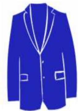
A BLUE JACKET