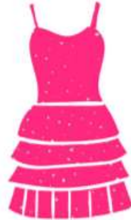
A PINK DRESS