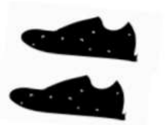
B BLACK SHOES