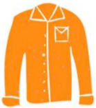
A N ORANGE SHIRT