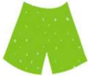
G GREEN SHORTS