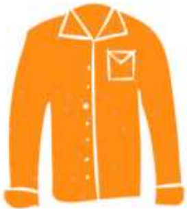
A ORANGE SHIRT