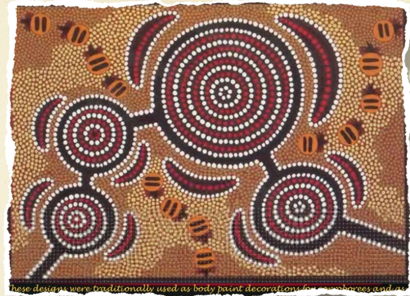
These designs were traditionally used as body paint decorations for men, women and children.