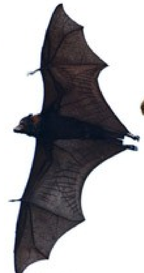
Black Flying Fox